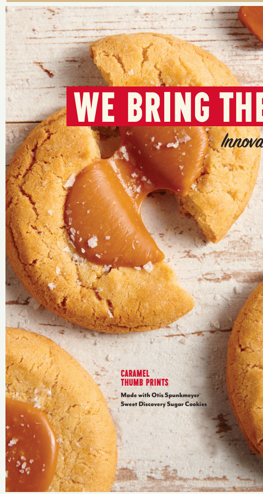
CARAMEL THUMB PRINTS Made with Otis Spunkmeyer Sweet Discovery Sugar Cookies