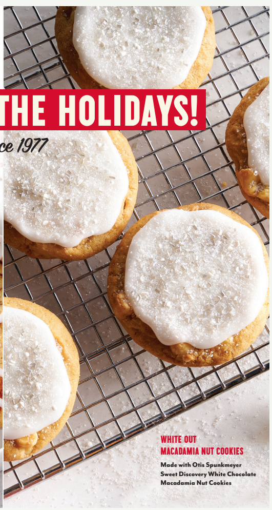
WHITE OUT MACADAMIA NUT COOKIES Made with Otis Spunkmeyer Sweet Discovery White Chocolate Macadamia Nut Cookies