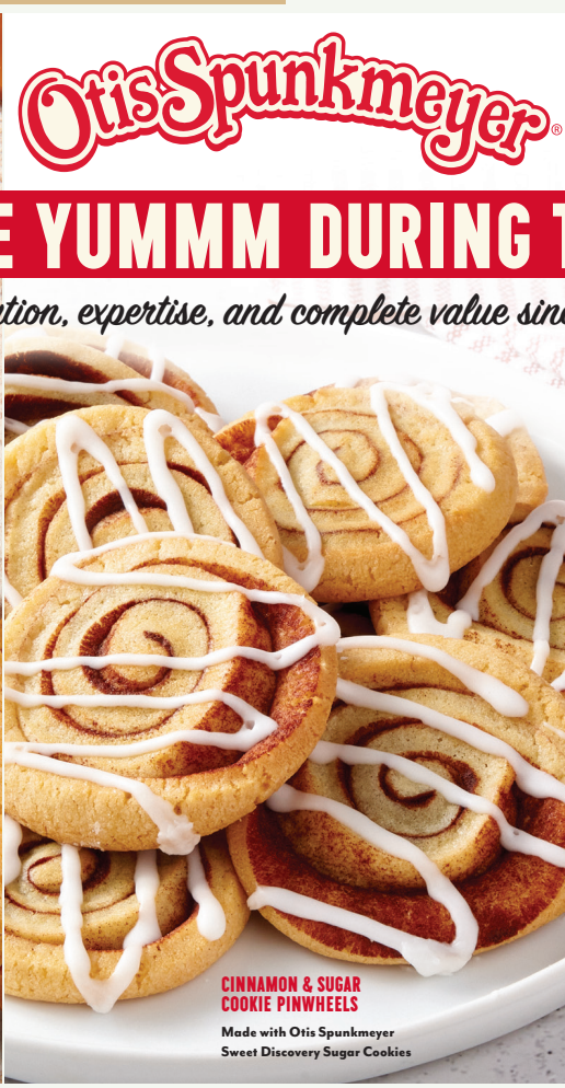
CINNAMON & SUGAR COOKIE PINWHEELS Made with Otis Spunkmeyer Sweet Discovery Sugar Cookies