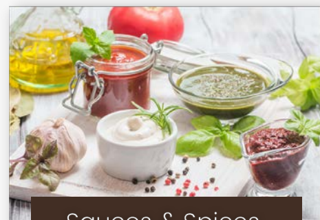
Sauces & Spices