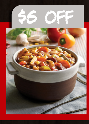
Chipotle Garden Vegetable Chili