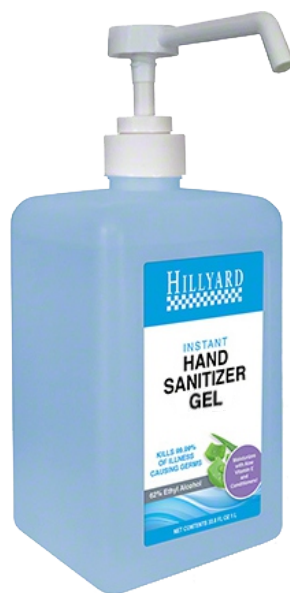
#22473 HILLYARD® SANITIZER HAND ALCOHOL ANTISEPTIC 62% 6/1000 ML.

80% Alcohol. Non-greasy and Fragrance free.