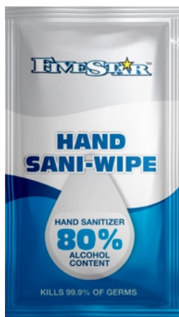
#22433 FIVE STAR® SANITIZER HAND WIPE POUCHES 80% ALCOHOL 1000/5" x 8"

They are quick, easy to use, and not harsh on your hands. These single use sanitizer wipes provide a clean, fresh, on-the-go experience and are ideal for restaurants, hotels, schools and PPE kits!