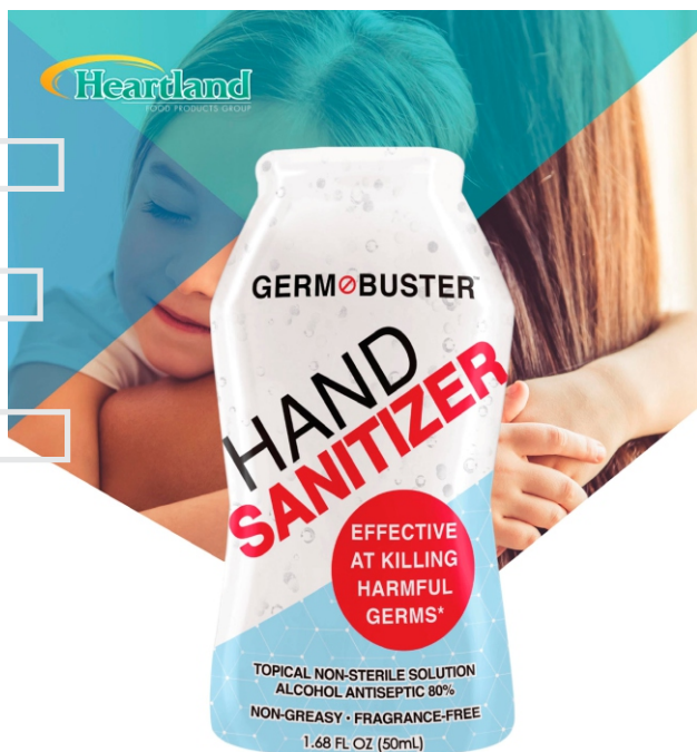
#22248 GERM BUSTER™ SANITIZER HAND 10/1.68 OZ.

80% Alcohol. Non-greasy and Fragrance free.