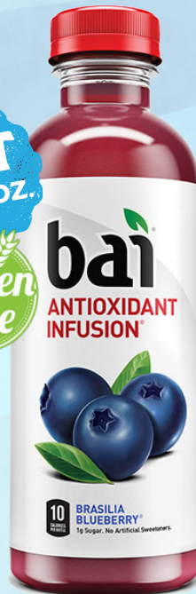
#3920 BLUEBERRY BRASILIA