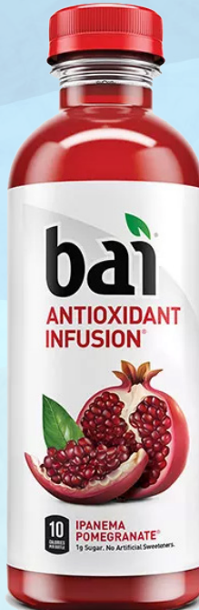
#3922 POMAGRANATE IPANEMA