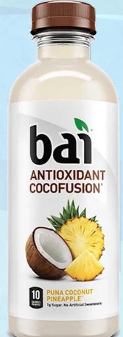
#3926 COCONUT PINEAPPLE