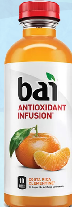
#3924 CLEMENTINE COSTA RICA