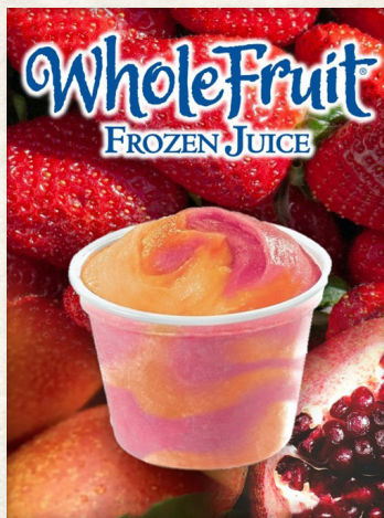
#42576 FRUIT JUICE MIX MANGO POMEGRANATE CUP I.Q.F. 96/4.5 OZ

Made with fair trade organic ingredients and no added sugar, Just Ice Tea™.