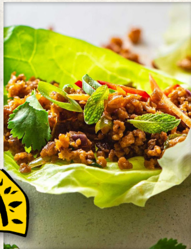
#34865 PLANT BASED ORGANIC GROUND MEAT CHUB FROZEN 4/2.5 LB

This plant-based meat, made from organic Sacha Inchi and fava bean protein, is free of the top 9 allergens, yet full of umami flavor and satisfying texture. Perfect for tacos, stir-fries, or scrambles—with zero net carbs and a complete protein punch.