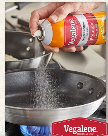
#18541 PREMIUM AEROSOL 3 OIL BLEND PAN SPRAY CANOLA/SUNFLWR/ SOY 6/17 OZ

These kettle chips pack sweet, spicy, and tangy crunch into every bold bite.