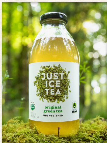
#2054 ORIGINAL ICED GREEN TEA UNSWEETENED GLASS 12/16 OZ

This ready-to-use liquid Peruvian cold brewed espresso is made with 100% Arabica coffee.