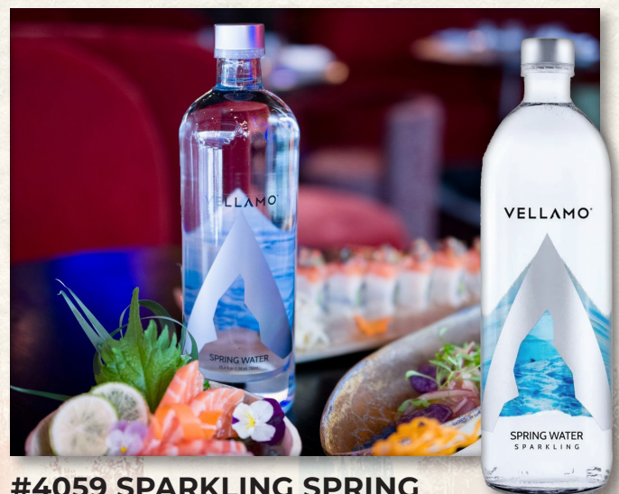
#4059 SPARKLING SPRING WATER GLASS 330 ML 20/11.16 OZ

Tempt your customers with a decadent ice cream sandwich—featuring a generous scoop of creamy ice cream, nestled between two old-fashioned oatmeal cookies and dipped in rich dark chocolate. A timeless treat with a modern twist that's guaranteed to delight.