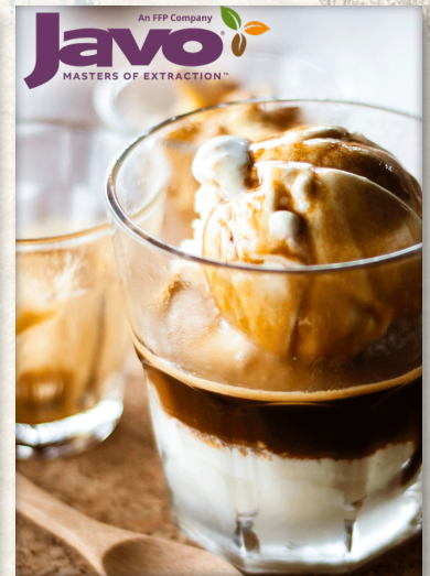
#21058 PERUVIAN ESPRESSO EXTRACT CONCENTRATE REFRIGERATED 6/64 OZ

Twist into tradition with this gluten-free Fusilli pasta. Crafted for those who crave the full-bodied joy of pasta, minus the gluten. Its signature spiral shape is built to cling to your favorite sauces, delivering flavor in every bite.