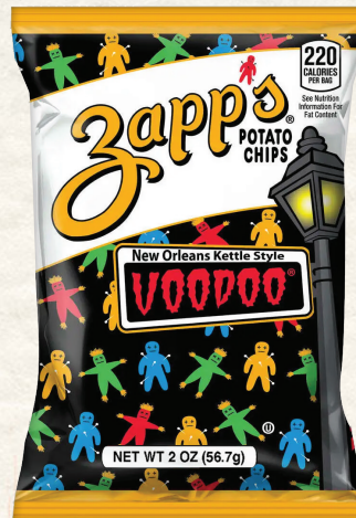
#20224 VOODOO® NEW ORLEANS KETTLE STYLE POTATO CHIP 25/2 OZ

Fun and tasty frozen juice cups with no added sugar or artificial colors and flavors.