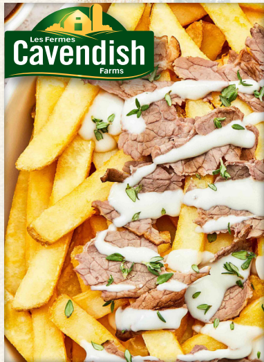
#40530 DOUBLE R™ STEAK CUT FRIES LINE FLOW I.Q.F. 6/5 LB

Along with superior potato taste, these fries offer quick prep times, great plate coverage and minimal breakage.