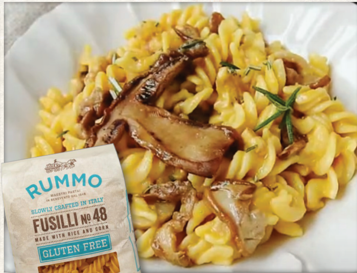
# 14302 RUMMO® GLUTEN FREE PASTA FUSILLI 12/12 OZ

Along with superior potato taste, these fries offer quick prep times, great plate coverage and minimal breakage.