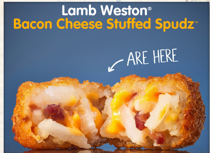
#40119 POTATO BACON & CHEESE STUFFED SPUDZ I.Q.F. 6/3 LB

Younger generations don't follow the old rules of a sit-down dinner with appetizers, entrees, and dessert. They want food that's social and can be enjoyed any time of day. These Bacon Cheese Stuffed Spudz™ are the perfect snackable and shareable addition to your menu.