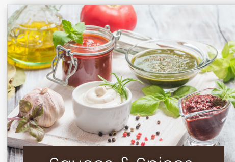
Sauces & Spices